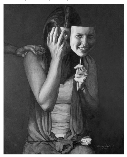
Fig. 02 Body -Imagetic exercise 02