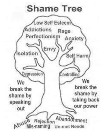
Fig. 04- The tree of shame.

The human organism with all of its interconnected systems working mirrors a tree. Photosynthesis as a creative process of transformation brings to conscious that creativity is beyond human experience being inherent to life in all its manifestations. Being grounded, in this perspective, becomes an ecologic posture, honoring the earth and being anchored in it might change the utilitarian view of the planet and broaden the concept of creativity so it is aligned to vital processes, at the same time supporting them and being supported by them.